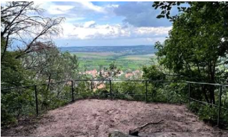
OTI de l'Alsace Verte

When you arrive at Buckelstein, take care but enjoy the view of the village of Oberbronn. Take a look at the engraved stones near the rock and the Club Vosgien plaque. Continue the climb towards Wasenkoepfel, following the markings + .