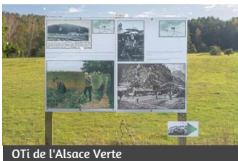
OTi de l'Alsace Verte

The works of painter and graphic artist Franz Hein were greatly inspired by the picturesque village of Obersteinbach. The landscape around Wasigenstein is clearly recognisable in his fantastic paintings and drawings. Fellow painters such as Karl Biese and Gustav Kampmann also visited this idyllic spot. But it was Franz Hein in particular who came here with his male and female 'Malweiber' students to work for days and