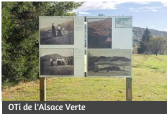
OTi de l'Alsace Verte

'With us, the new time arrives !' The era of reform begins : 'Lebensreform', life reform, critical movement against industrialisation in Germany, 'Reformation' clothes, simple lifestyle, return to nature, nutritional reform, vegetarian diet, renunciation of alcohol, biodynamic gardening and farming, health food shop, women's rights, emancipation, women's right to vote, new paths in painting and architecture.