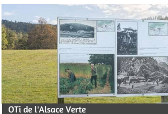
OTi de l'Alsace Verte

Franz Hein s'est engagé dans l'Art Nouveau, les oeuvres de ses élèves apparaissent plus modernes, ne se perdent pas dans de petites formes décoratives morcelées, mais captent les grandes lignes et les ambiances. L'effervescence artistique des femmes voit ainsi le jour.