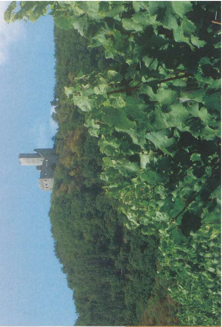
Fig. A. Diller - 1700 ans - 10/2017